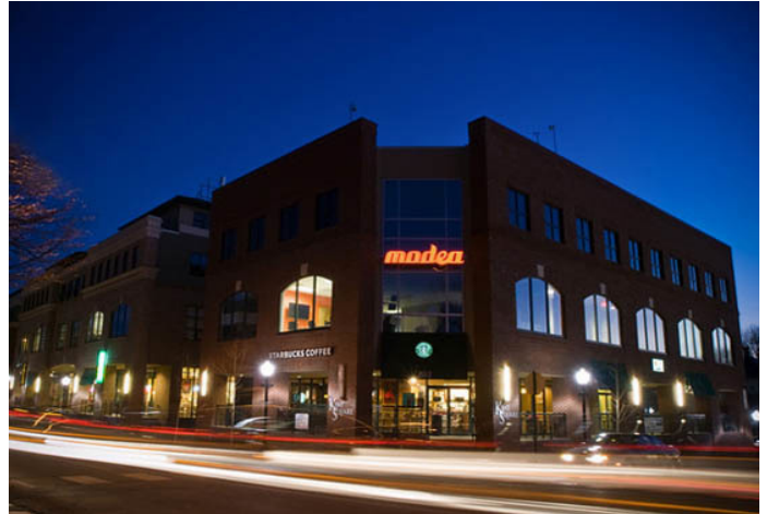
202 S Main St, Kent Square, Blacksburg