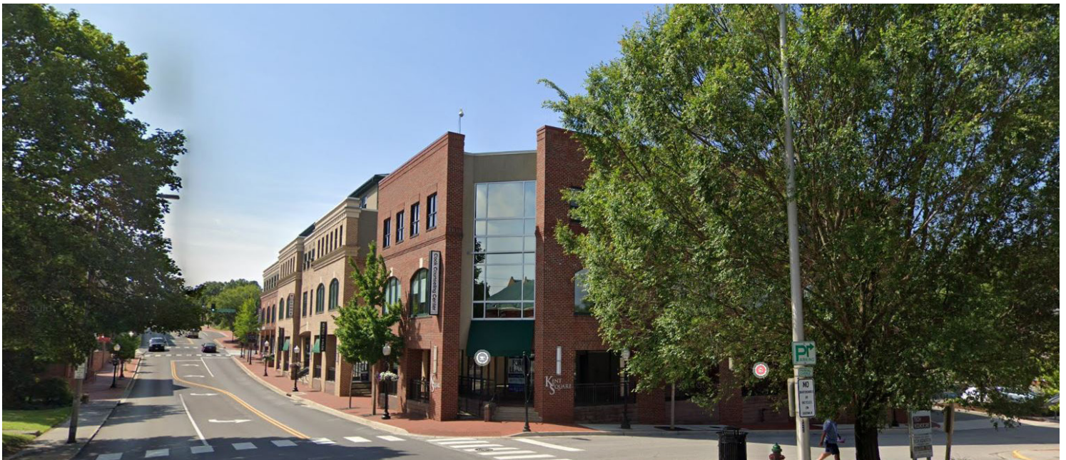
202 S Main St, Kent Square, Blacksburg